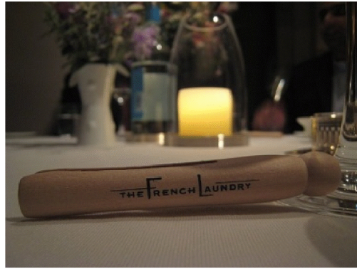
The French Laundry