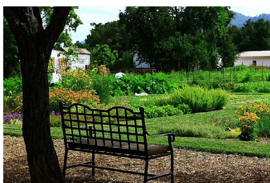
Vegetable Garden French Laundry

This relay demonstrates a text-image association in which the text extends or re-conceptualizes the visual information about the nature of the experience that is offered by the restaurants. The interpretation of narrative images on the website is additionally directed by the presence of what Kress and van Leeuwen (1996: 67) define as 'secondary participants'.