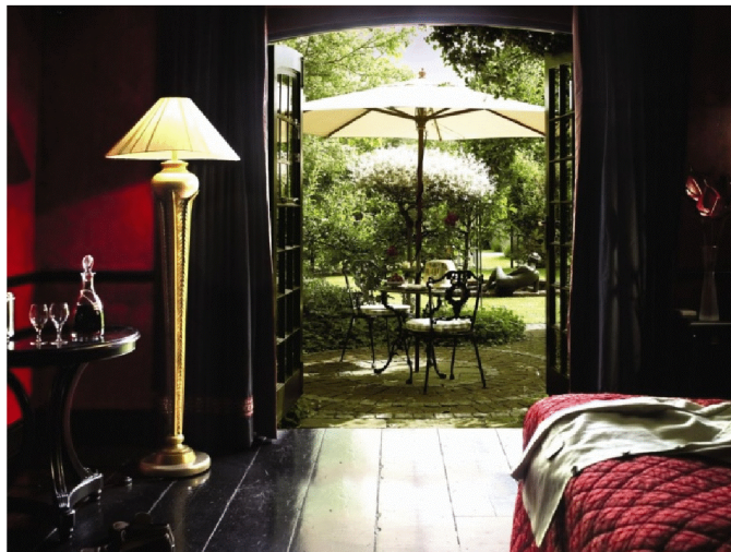
Figure 3: Le Manoir Bedroom

In order to understand the significance of the language of tourism developed and utilized in the restaurant websites, it is important to understand the meaning of the employed language, and how it is constructed. The following sections explore the significance of this semiotic language. The marketing of 'Le Manoir aux Quat'Saisons', 'The French Laundry' and the 'Gramercy Tavern' provide access for the consumer to a sensual world of luxury and hedonism in which food and the experience of dining are elevated from the mundane to a multi-sensual experience in which food, landscape and philosophy merge as one. Hospitality marketing utilizes what Dawkins (2009: 34) labels '...the semiotics of the senses'. The marketing of experience differs from other sectors, such as fashion marketing, as the selling of experiences is not tangible. We cannot test drive or try the experience on as we can only feel or consume it once. The experience will differ every time we re-visit it, as is the case with experiences whereby marketers endeavor to immerse consumers in a sensual world of luxury and indulgence.